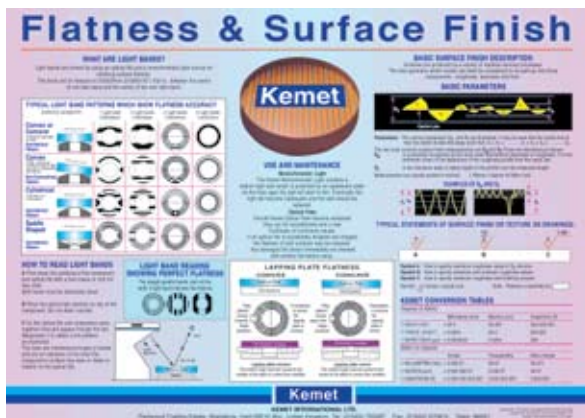
Flatness Reading Wall Charts are available upon request