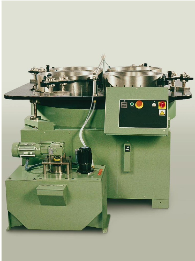
Picture of Kemet 56 lapping machine without Kemet Diamond Dispensing System

The Kemet 56 Lapping Machine is equipped with a 56 inch (1422mm) diameter serrated lap plate. The lap plate consists of 24 cast iron individual segments bolted to a support plate.