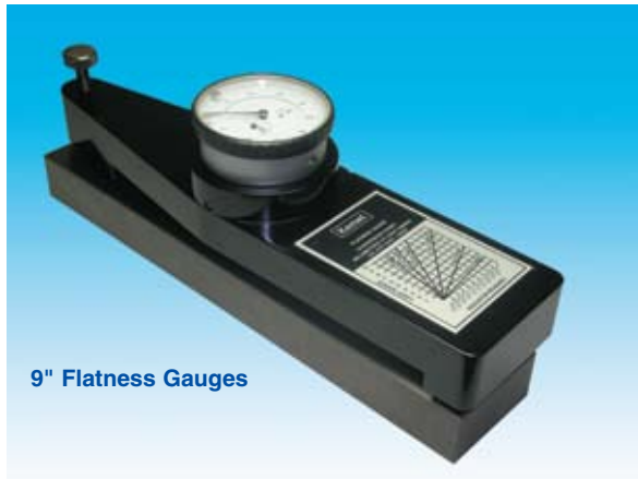
9" Flatness Gauges

The Flatness Gauges are used to monitor lapping plate flatness, which, in turn, gives an indication of component flatness. Available for most machine sizes, in metric calibration, the gauges are supplied in a case with a master setting block. Full instructions are provided.